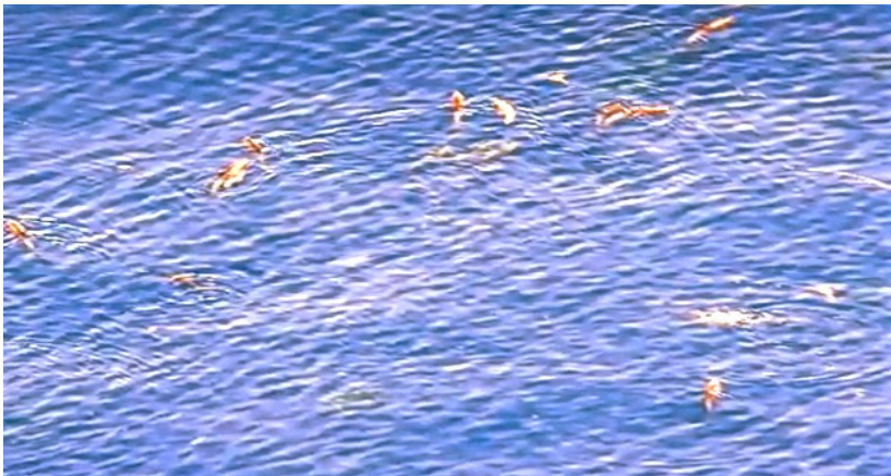
Photo by John L Wathen , from video. Dolphin pod struggling in the oil in the Gulf of Mexico.

Then this pod of dolphins some already dead, some in their death throes (min 7:00)