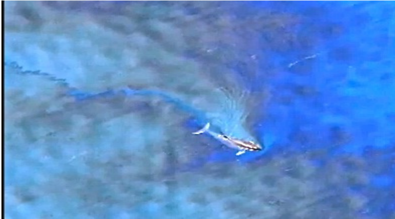
Sperm whale swimming in the oil.

Then we saw this guy, a sperm whale swimming in the oil, had just breached, along his back, we could see red patches of crude, as if he had just been basted for broiling